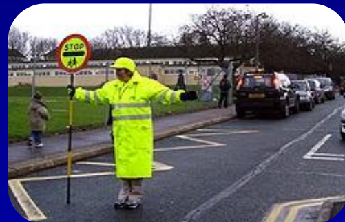
Example Traffic Management Plan