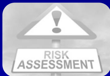
Example Traffic Management Risk Assessment